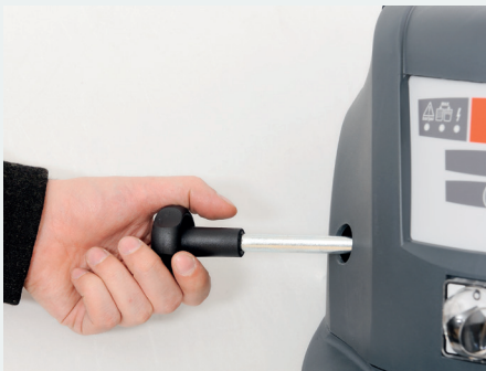
Manual filter shaker