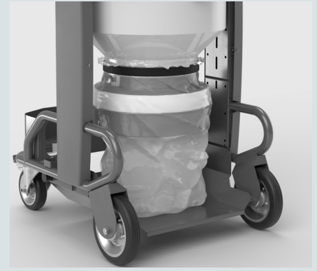
S3 with gravity unload system with Longopac®