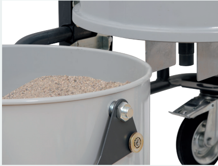
Solid cut-off system