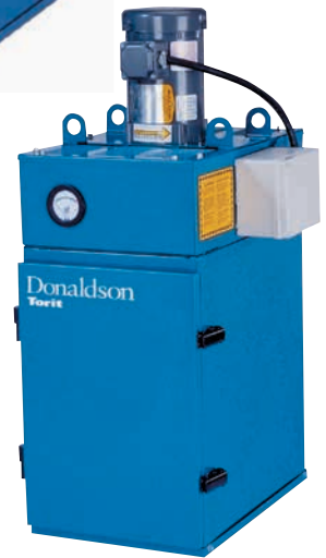
MM 1200 with Optional Junction Box