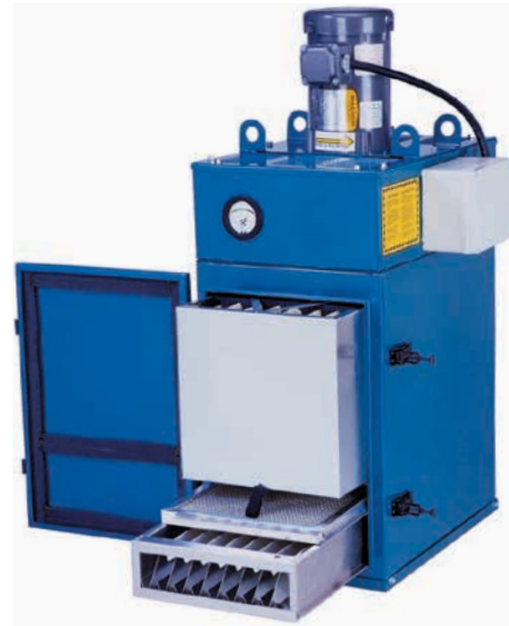
MM 1200 with Optional HEPA